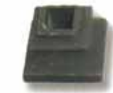
HF16.3.1 1/2" Sq. Opening