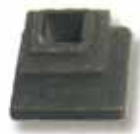
HF16.3.19 1/2" Sq. Opening with Set Screw