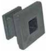
#351 1/2" Fits: 1/2" Sq. Height: 1-1/6" 1-5/8 Sq. Base 100 PCs per box Economy Shoe No Set Screw