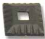
HF16.3.4 1/2" Sq. Opening