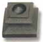
HF16.3.18 1/2" Rd. Opening