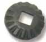
HF16.3.5 1/2" Sq. Opening