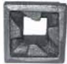
#352 1/2" Fits: 1/2" Sq. Height: 1-1/6" 1-1/4 Sq. Base 100 PCs per box No Set Screw